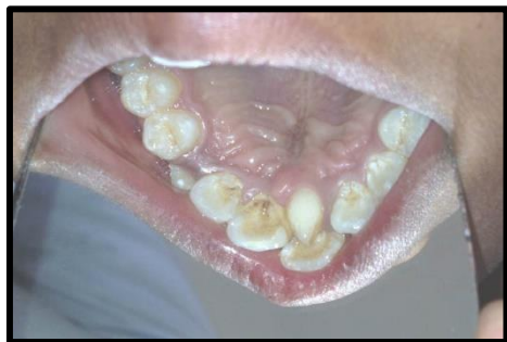
Fig. 1: Mesiodens between 11 and 21