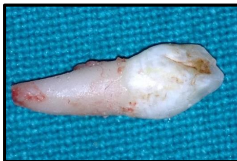
Fig. 3: Extracted mesiodens