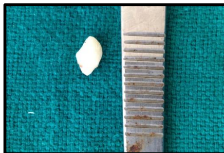
Fig. 4: Excised lesion