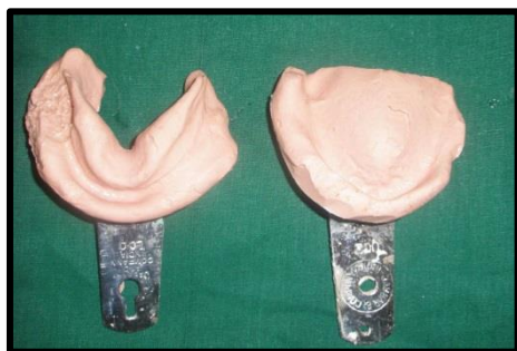
Fig. 1: Alginate impressions of maxillary and mandibular arches