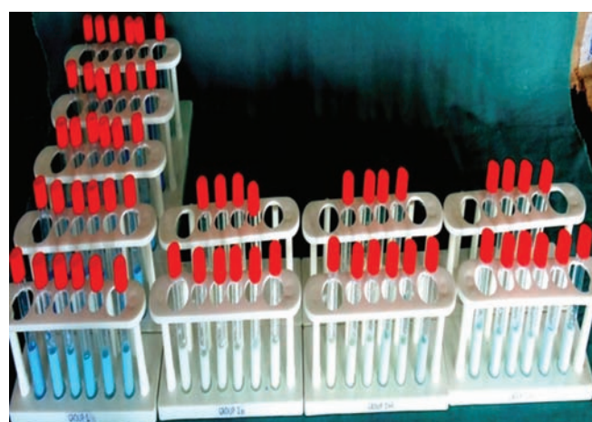
Fig. 4: Color change of the samples at the end of observation