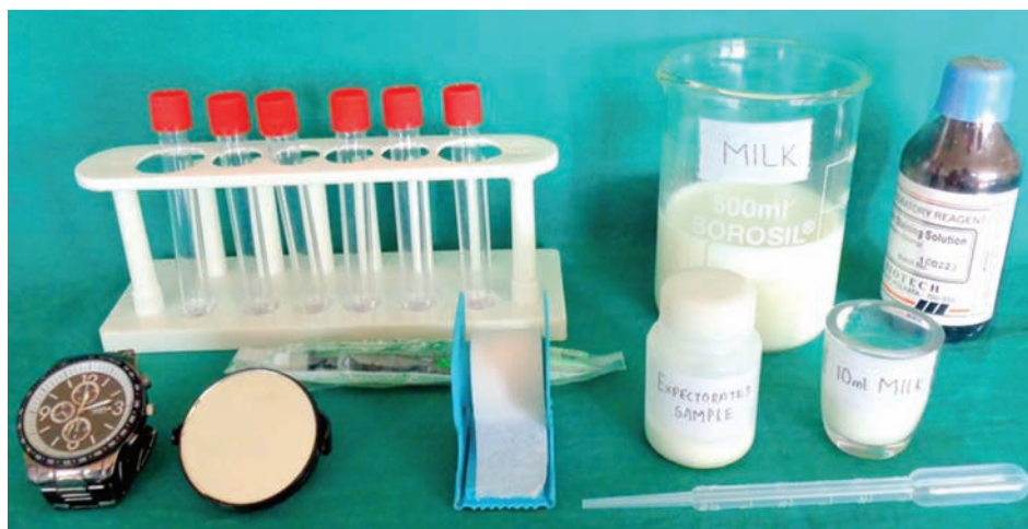
Fig. 1: Armamentarium