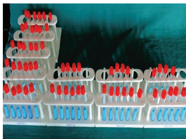
Fig. 3: Expectorated samples at the beginning of observation

The children were asked to rinse their mouth vigorously for 30 seconds with 10 mL of ultra-high-temperature sterilized cow's milk (Fig. 2). The expectorate was collected in a sterile beaker, and 3 mL of this was immediately transferred with a disposable syringe to a screw cap test tube, which contained 0.12 mL of 0.1% methylene blue. (0.1% methylene blue was obtained by mixing 100 mg of methylene blue in 100 mL of distilled water). The expectorated milk and methylene blue was thoroughly mixed and the test tube was placed on a stand in a well-illuminated area. A mirror was used to detect any color change (blue to white) in the bottom of the test tube every 5 minutes. The time taken for the initiation of the color change within a 6 mm ring was recorded (Figs 3 and 4). The data were collected and analyzed using Statistical Package for the Social Sciences (SPSS) version 7. The tests used were chi-square test, Mann-Whitney "U" test, analysis of variance (ANOVA), and Spearman's rank correlation.