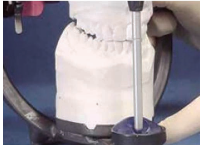
Fig. 4: Mounted casts of cemented provisional restorations