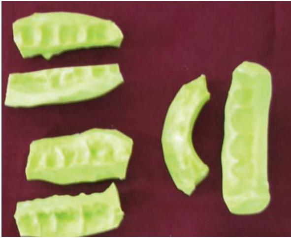
Fig. 3: Putty indexes fabricated for provisional restoration