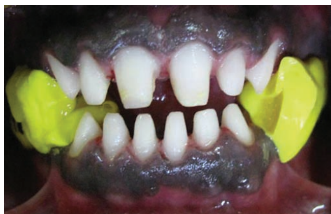
Fig. 1: Evaluation of anterior teeth preparation with the help of posterior index