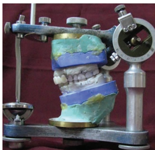
Fig. 2: Diagnostic wax-up