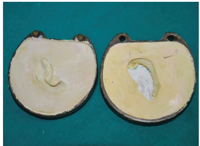
Fig. 8: Dewaxing of the wax pattern

accordingly (Fig. 5). Patient and patient's family member opinions were taken during auricular wax try-in procedure regarding any modification. After final correction, to get proper adaptation to the tissue, reline impression was made with light body polyvinylsiloxane impression material after applying the tray adhesive in the fitting surface of the wax pattern (Figs 6 and 7).