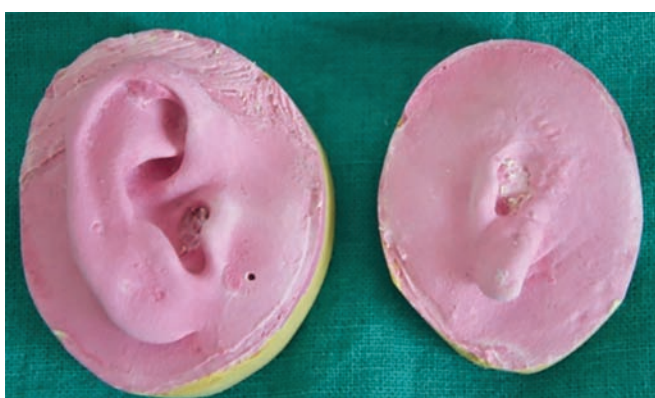
Fig. 3: Stone models for both ears