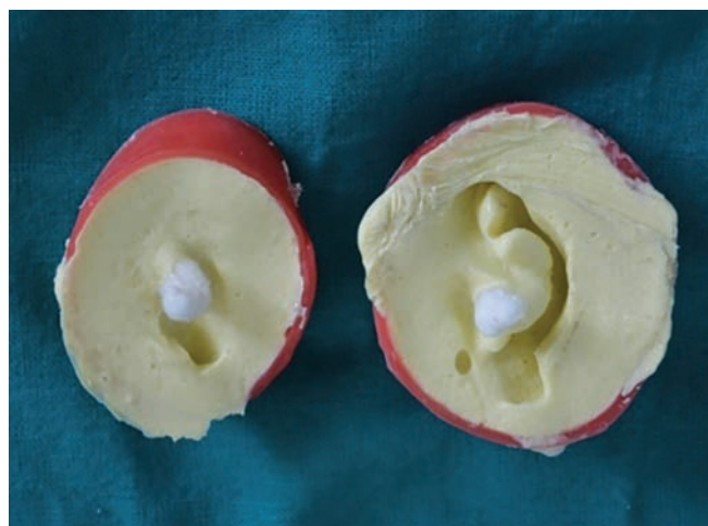
Fig. 2: Impressions of both ears