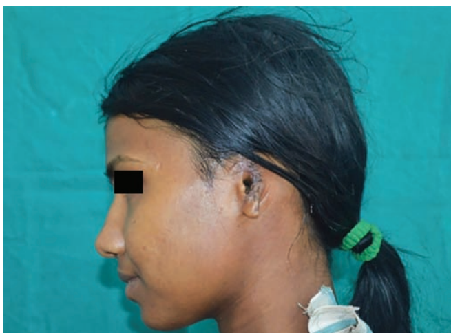
Fig. 1: Defective left ear