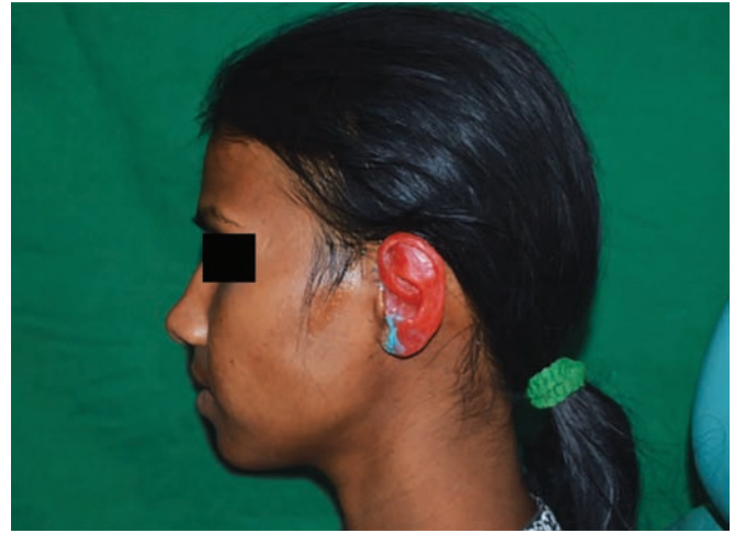
Fig. 6: Relined impression of the wax pattern