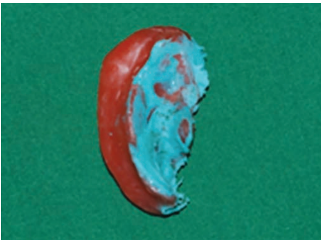
Fig. 7: Relined auricular wax pattern