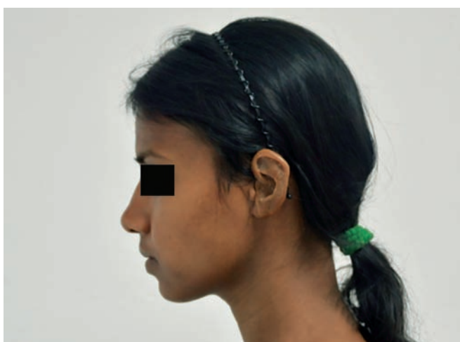
Fig. 11: Lateral view of final prosthesis in place