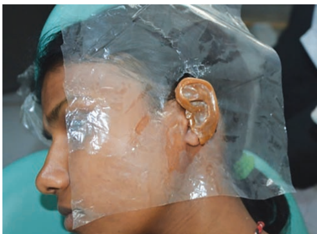
Fig. 9: Attaching finished prosthesis with hair band