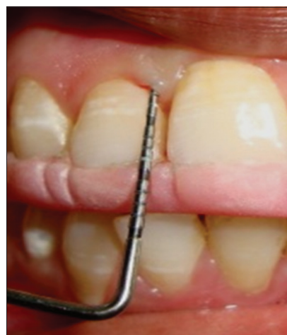
Figure 9: Post-operative measurements at 6 months Fixed reference point to base of pocket