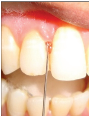
Figure 5: Subgingival application of polyglycolic acid-based 0.5% azithromycin gel into the pocket