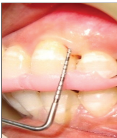
Figure 11: Post-operative measurements at 6 months: Fixed reference point to base of pocket

desired clinical outcomes, and the patient's dental and medical history. [14]