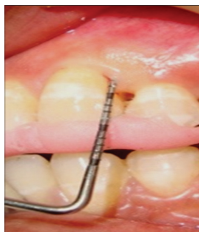
Figure 10: Experimental site B Post-operative measurements at 3 months Fixed reference point to base of pocket

limited side effects, and it does not need to be administered daily for a defined time period. On the other hand, systemic administration of antibiotics facilitates treatment of bacterial reservoirs of reinfection such as the tonsil, saliva, and tissue invasive bacteria. It also is more