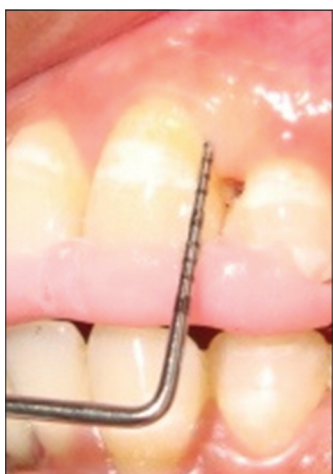
Figure 6: Experimental site B Baseline measurements ("0" day) Fixed reference point to base of pocket