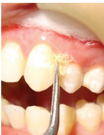
Figure 7: Subgingival application of tetracycline fiber 2 mg into the pocket