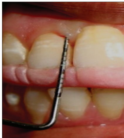
Figure 8: Experimental site A Post-operative measurements at 3 months Fixed reference point to base of pocket