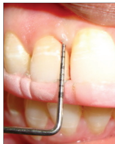
Figure 4: Experimental site A Baseline measurements ("0" day) Fixed reference point to base of pocket

A local route of drug delivery can attain 100-fold higher concentrations of an antimicrobial agent in sub-gingival sites compared with a systemic drug regimen. It is possible that chemical antimicrobial agents locally applied into periodontal pockets may further suppress periodontal pathogens and thereby augment the effects of conventional mechanical periodontal therapy. [4]