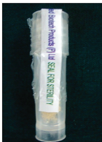
Figure 2: Sterile container of tetracycline hydrochloride fibers (2 mg)

was 1.77 \pm 1.12 at 3 months ( P < 0.0001 ) and 2.27 \pm 0.36 at 6 months ( P < 0.0001 ) for experimental Group B, respectively [Table 2]. When a comparison was made between the experimental groups, the experimental group A scored significantly better at 3 months ( P < 0.05 ) and 6 months ( P < 0.05 ) reexamination visit.