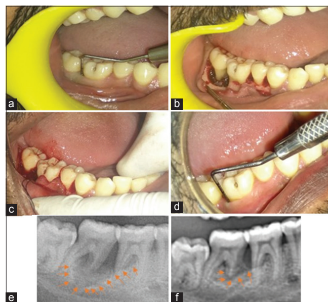
Figure 2: (a) Pre-operative (PPD). (b) Intra-operative photograph. (c) Insertion of mixture of PRF and bioactive glass at the surgical site. (d) One year Post-operative PPD. (e) Pre-operative radiograph. (f) 1 year post-operative radiograph