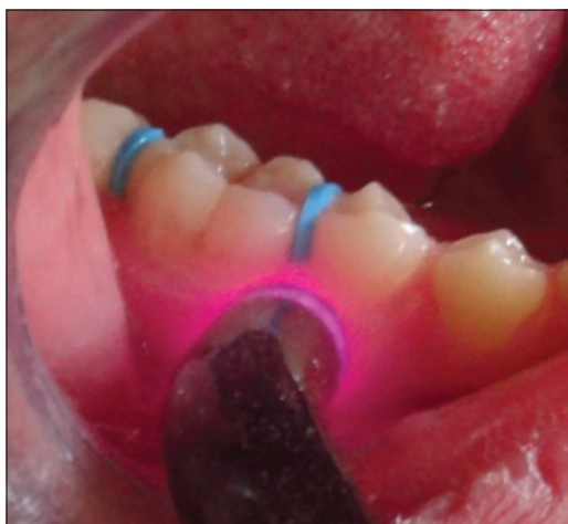
Figure 2: Laser application after separator placement

significant ( P = 0.008 ) [Table 1]. It also shows pain level in the laser side decreased by passing the time, and it was statistically significant, and the maximum pain level was day 2, and minimum was day 5 after laser therapy. Pain level in the control side decreased by passing the time, and it was statistically significant, and the maximum pain level was on 2 nd day, and minimum was on 5 th day after laser therapy. No statistical significance was found for both low-level laser energy values in comparison to the corresponding control group.