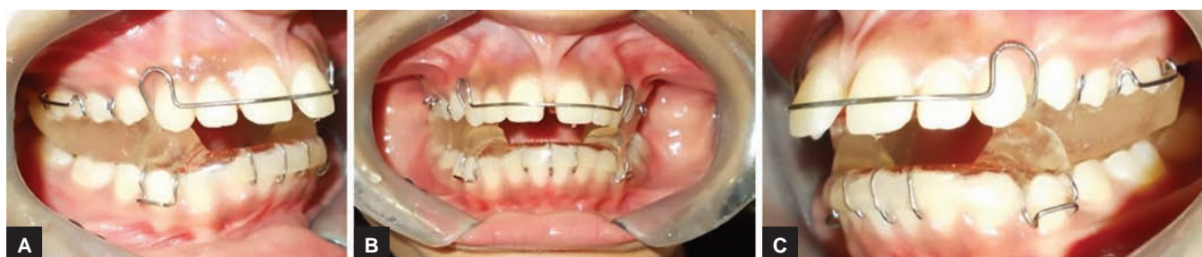
Figs 2A to C: Twin block appliance by Dr Clark

growth spurt so as to balance the mismatching skeletal bases, followed by fixed mechanotherapy to align and level both arches plus closure of midline diastema. 3,4 The final objective was to attend patient's distressed unpleasant soft tissue profile.