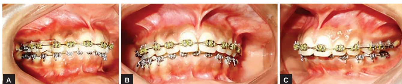
Figs 4A to C: Fixed mechanotherapy to settle teeth