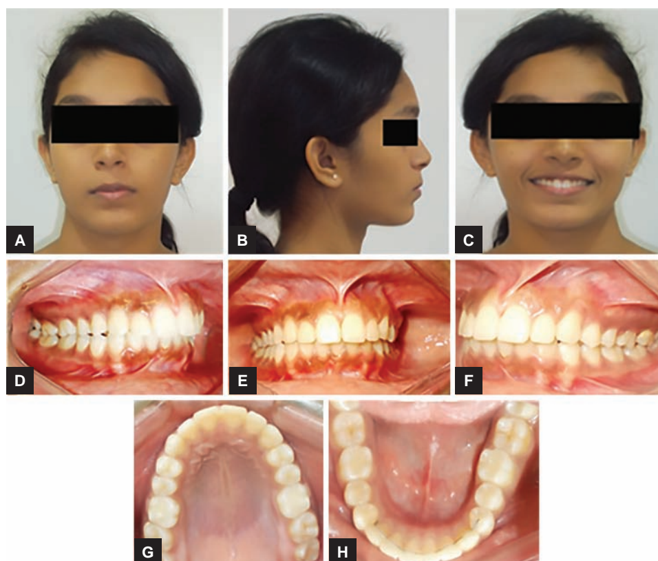
Figs 5A to H: Postoperative intraoral and extraoral photographs