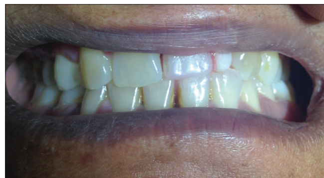
Figure 4: Wax try in