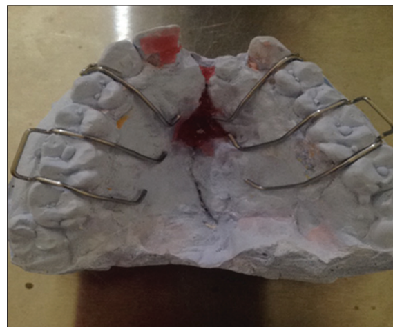
Figure 3: Master cast