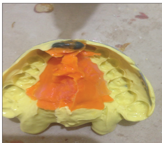
Figure 2: Final impression