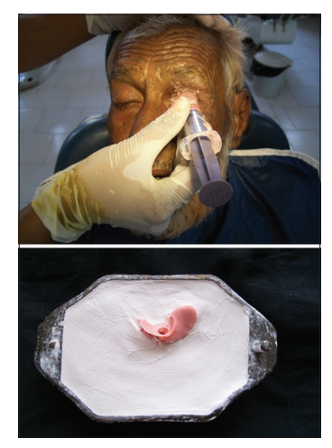
Figure 2: (a and b) Primary impression