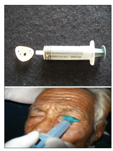
Figure 3: (a and b) Final impression

placed before setting of alginate, and dental plaster was poured over it. Once the plaster was set, the patient was instructed to wriggle the face so that the impression could be easily removed and inspected for any deficiency. As no deficiencies were found, the final impression thus obtained was poured using dental stone by two-piece mold technique with orientation grooves.