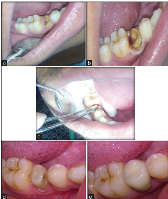
Figure 4: (a) Post-placement, (b) core build up, (c) PFM crown, (d) Pre-operative, (e) crown lengthning

using nanohybrid type particulate filler composite resin [Figure 1(d)]. Successful chemical bond between fiber framework and veneered composite was achieved by light curing. The shade of final veneered composite resin was selected using composite shade guide, and occlusion was carefully adjusted with articulating paper. The occlusion was adjusted carefully to avoid any primary or premature contacts [Figure 1(e)] both in centric and eccentric and also to prevent traumatic occlusal forces to the restored teeth [Figure 1(f)].