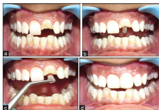
Figure 3: (a) Pre-operative, (b) with EverStick post, (c) Shaping of post, (d) post-operative

transparent silicone package (mold) of the fibers. The resin impregnated fibers were light cured initially through the silicone mold. The purpose of the flowable composite was to seal the space between the fibers and the enamel surface. The fiber framework was polymerized 2 times for 40 s each. The fiber framework was then fully covered with a thin layer of flowable composite resin, and the pontic was built up layer by layer